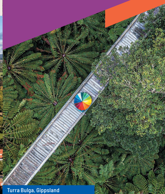
Turra Bulga, Gippsland