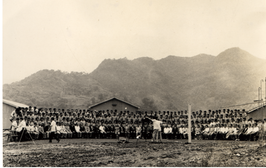
June 11, 1960 Group photo of the Inaugural Class