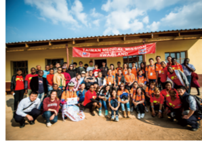
2008 Medical Mission in Kingdom of Eswatini