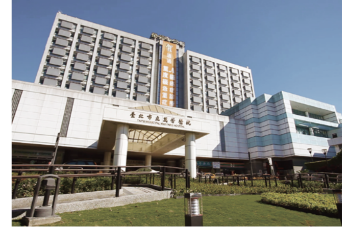
July 17, 1996 Taipei Municipal Wanfang Hospital