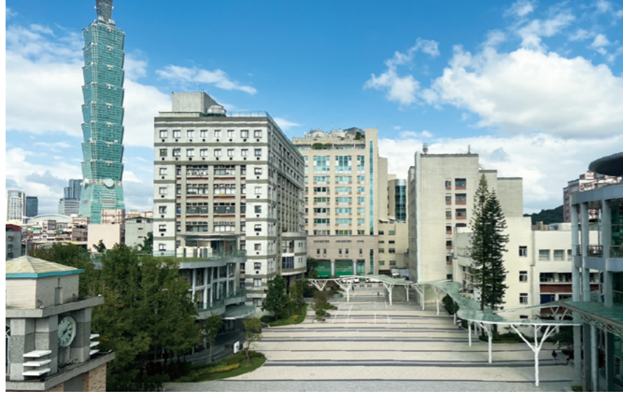
Taipei Medical University