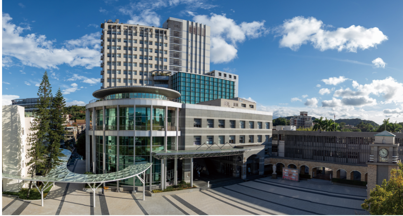
Translational Cancer Research Center's Academic Research Team