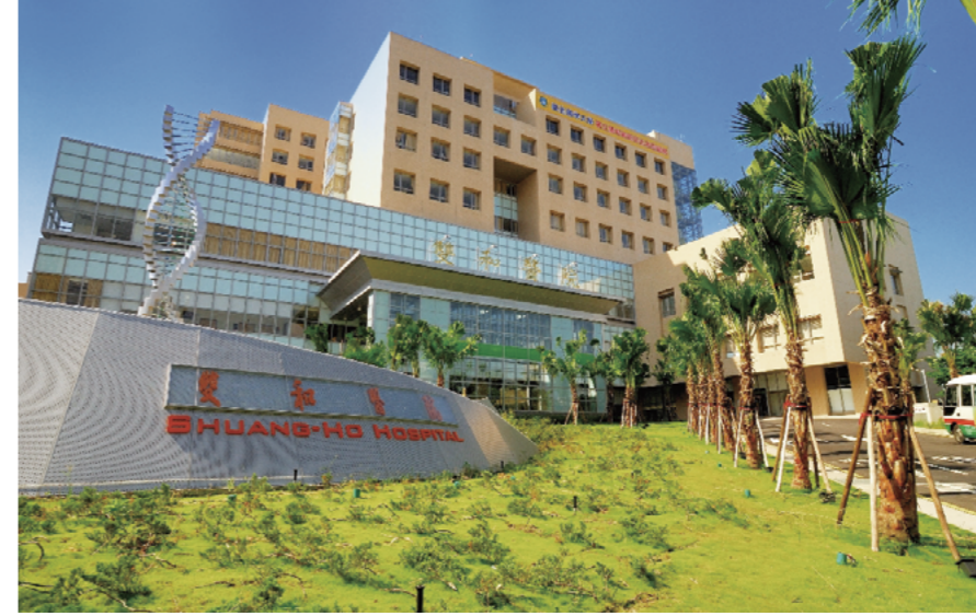
July 1, 2008 Shuang Ho Hospital