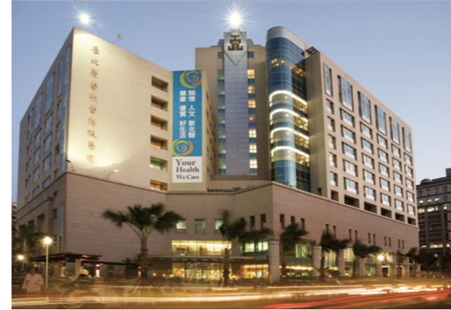
August 1, 1976 Taipei Medical University Hospital