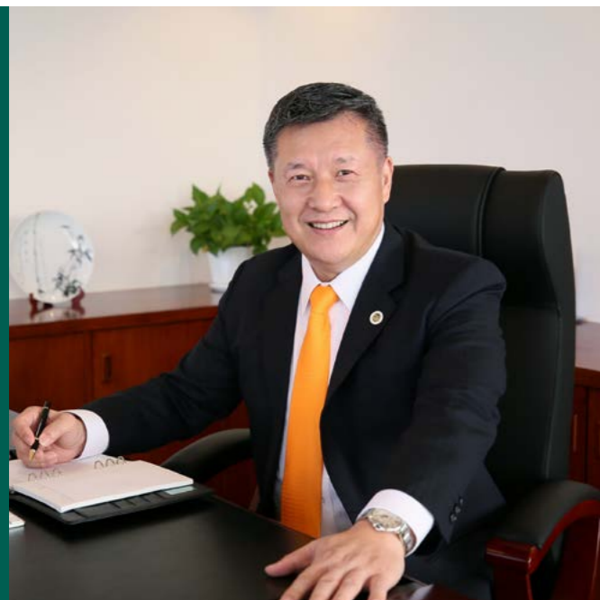
澳門城市大學校長 Rector of City University of Macau