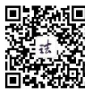
School of Law WeChat