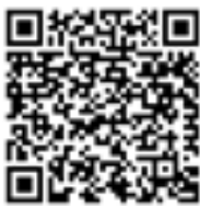
School of Law Website