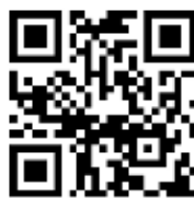
School of Law Facebook