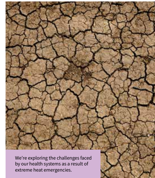
We're exploring the challenges faced by our health systems as a result of extreme heat emergencies.