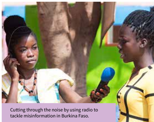
Cutting through the noise by using radio to tackle misinformation in Burkina Faso.