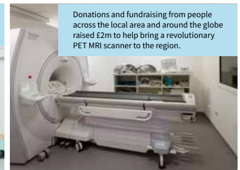
Donations and fundraising from people across the local area and around the globe raised £2m to help bring a revolutionary PET MRI scanner to the region.