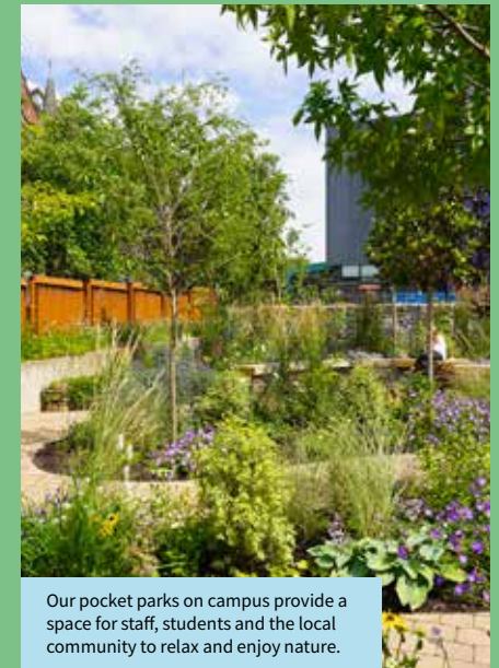
Our pocket parks on campus provide a space for staff, students and the local community to relax and enjoy nature.