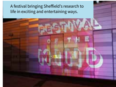
A festival bringing Sheffield's research to life in exciting and entertaining ways.