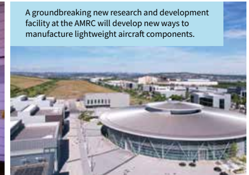
A groundbreaking new research and development facility at the AMRC will develop new ways to manufacture lightweight aircraft components.