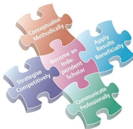
Research Degree Students

On graduation, CityU research postgraduate students will be able to achieve the following: