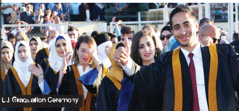
UJ Graduation Ceremony

UJ enriches university life through one of the largest libraries in the country, five museums, a broad sports complex and cultural events; opendialogues, quality public lectures, art exhibitions and musical performances.